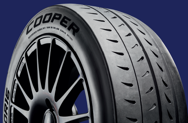
COOPER DISCOVERER TARMAC DT1