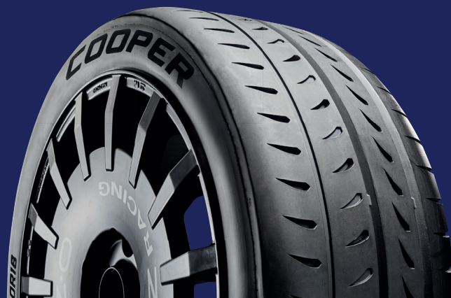
COOPER DISCOVERER TARMAC DT02