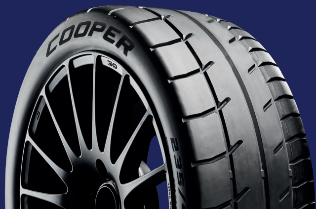
COOPER RALLY CLASSIC TARMAC CTO1