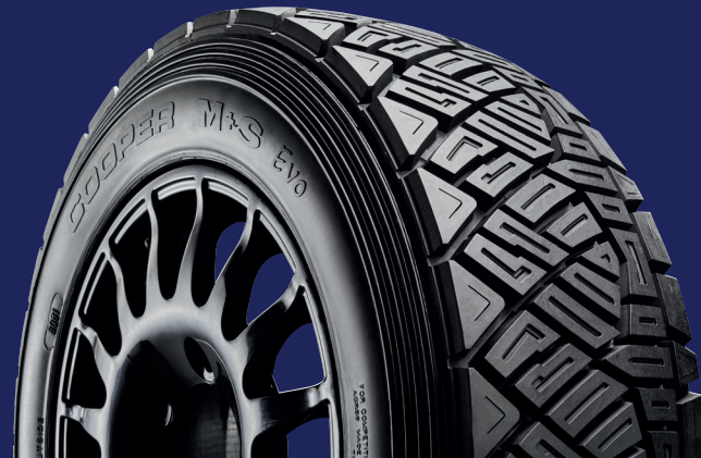
COOPER M+S EVO

CONFIDENCE-INSPIRING PERFORMANCE FOR THE MOMENTS THAT COUNT