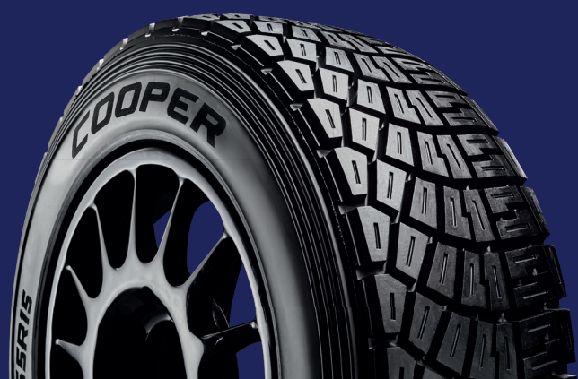
COOPER DISCOVERER GRAVEL DGI